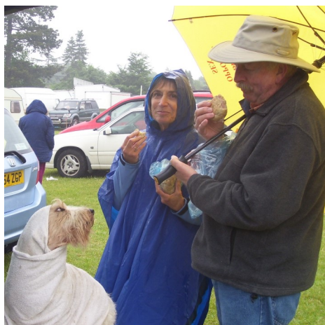
"Hey you, under the umbrella. I'm with you!"

MANY PEOPLE JOIN A BREED CLUB when they buy a dog. Others join when wanting to learn more about a type of dog that they are thinking about owning. The BGV Club is special as it embraces two breeds—the Petit and Grand Basset Griffon Vendéen.